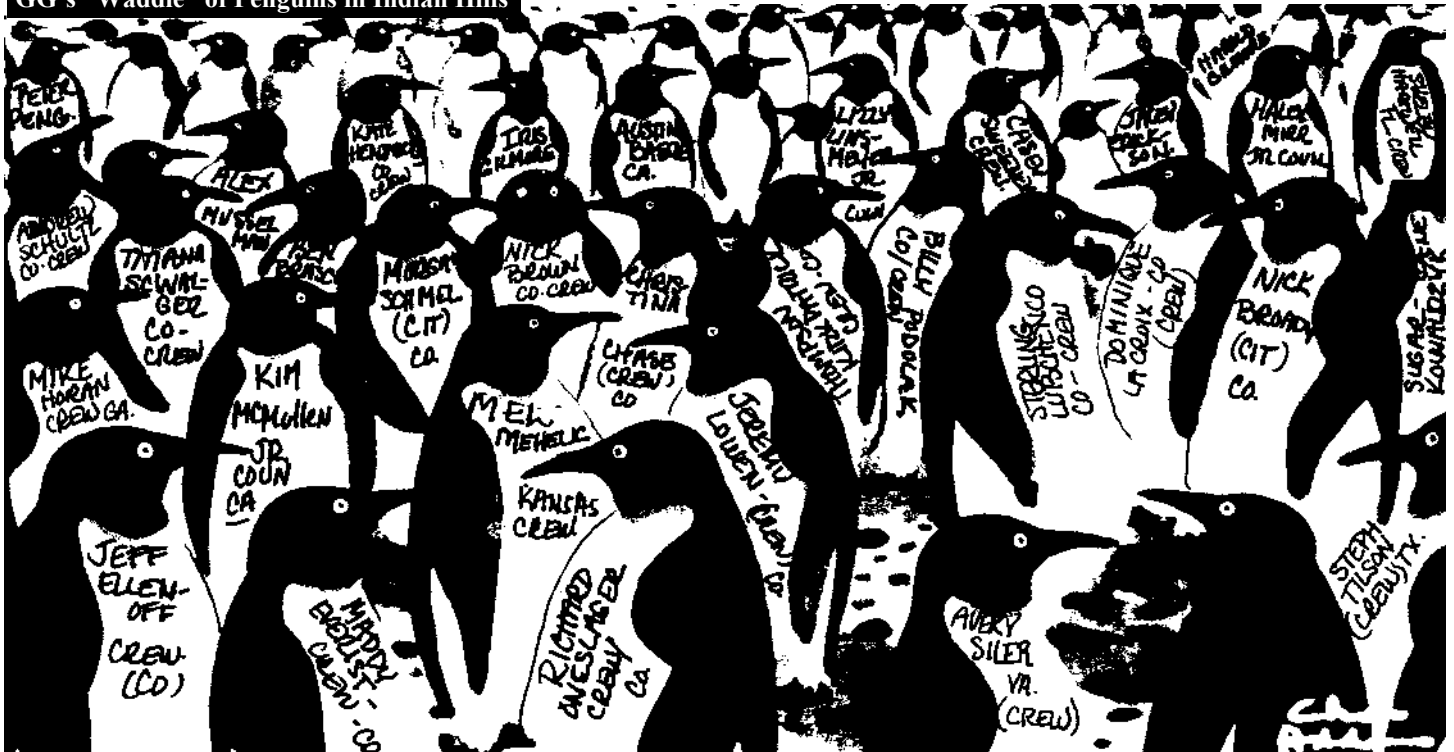
Each year Geneva Glen “grows” its own counselors & crew (usually 90% of our staff come from the former camper ranks). Check out our latest batch of first-time staff who are former campers (above).