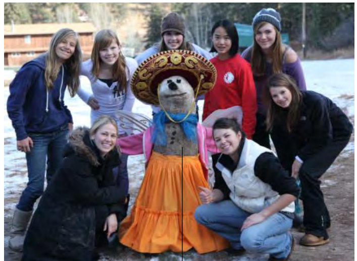
This eclectic snowman — made at "The Xhopper" — was more mud and sand than frosty stuff.

it back into a softball diamond – right after Mudpie Mania in Myths.